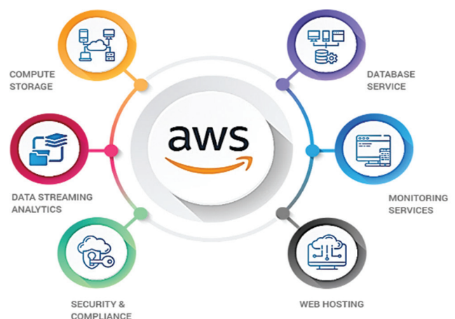
Figure 3: Amazon web services