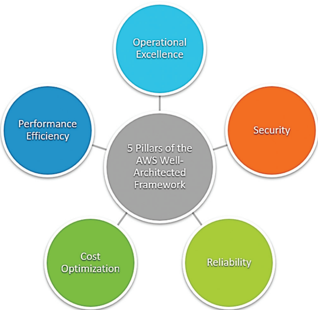
Figure 2: The 5 pillars of the AWS well-architected framework

All of these SaaS, IaaS, and PaaS solutions work together to provide a scalable way to help your company deploy apps effectively. The present cloud war between Google Cloud, Amazon AWS, and Microsoft Sky Blue clearly places AWS at the top of the list of major cloud providers. [10] AWS has a significant advantage with a 5-year head start in the cloud computing market, holding around one-third of the market share. It offers a vast range of services across various locales and availability zones, supporting all major operating systems, such as macOS and Windows. AWS is known for its continuous innovation, constantly expanding its service offerings, including widely-used solutions, such as blockchain. Its broad selection of services