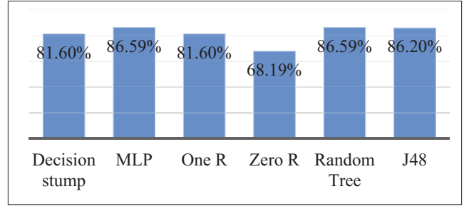
Figure 2: Accuracy of classifiers